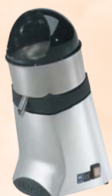
# 52C Chromed