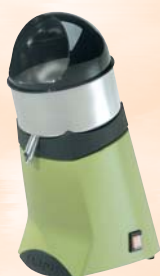
# 52 Yellow