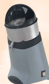
# 52 Grey